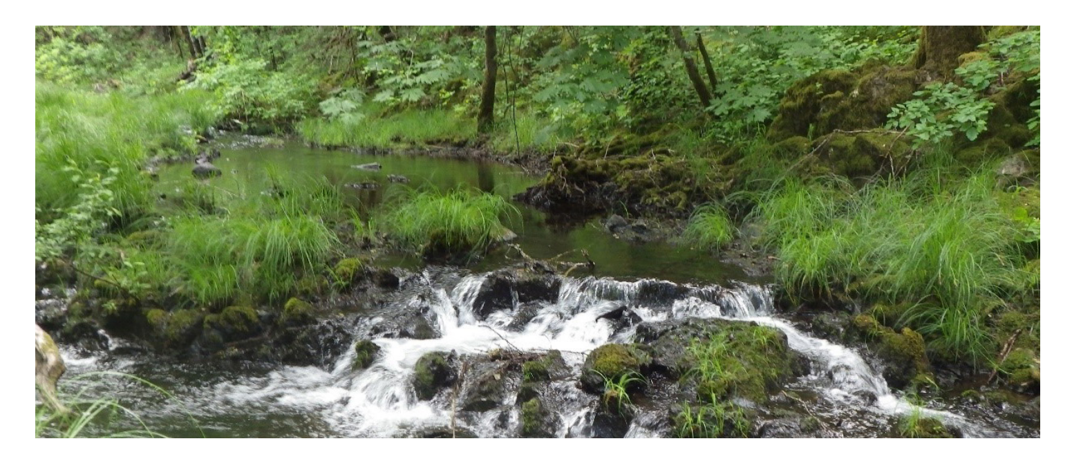
CDFW Groundwater Planning Considerations